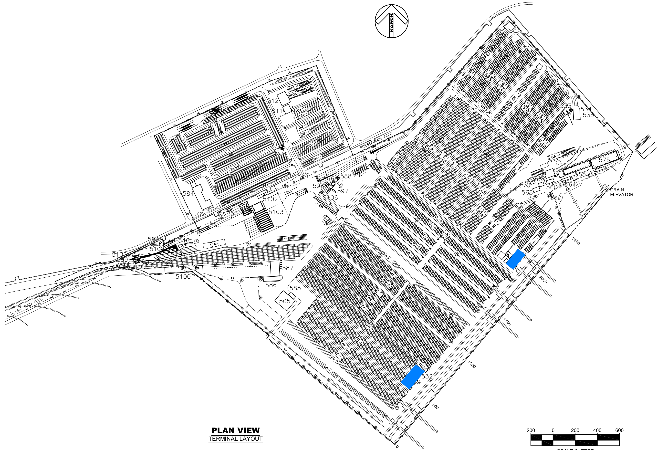
PLAN VIEW TERMINAL LAYOUT