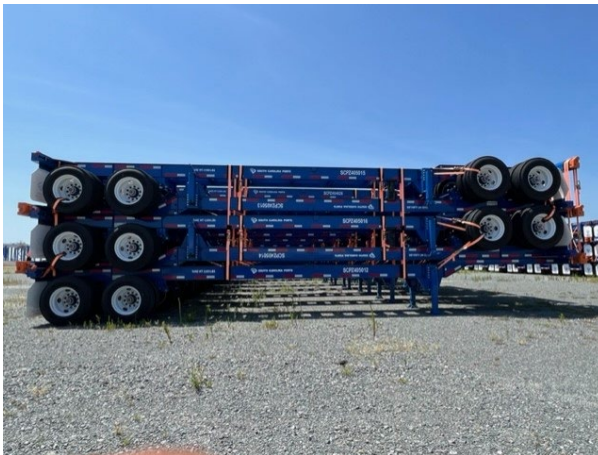
Chassis Bundles – Strapped, Side View