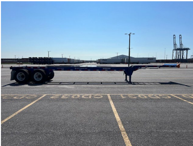
Typical Chassis – Side View