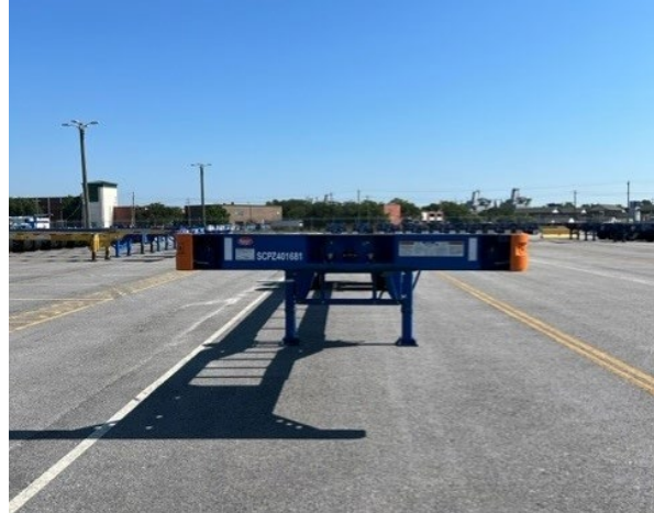
Typical Chassis – Front View