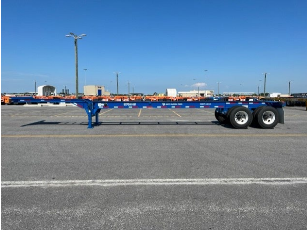
Typical Chassis – Side View