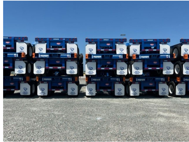
Chassis Bundles – Not Strapped, Back View