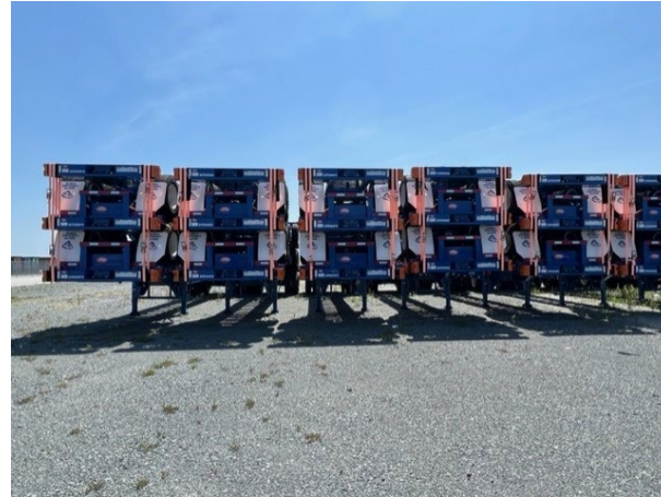
Chassis Bundles – Strapped, Back View