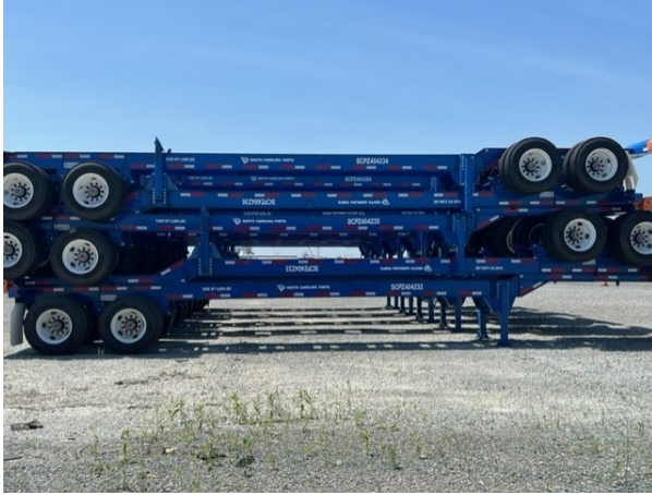
Chassis Bundles – Not Strapped, Side View